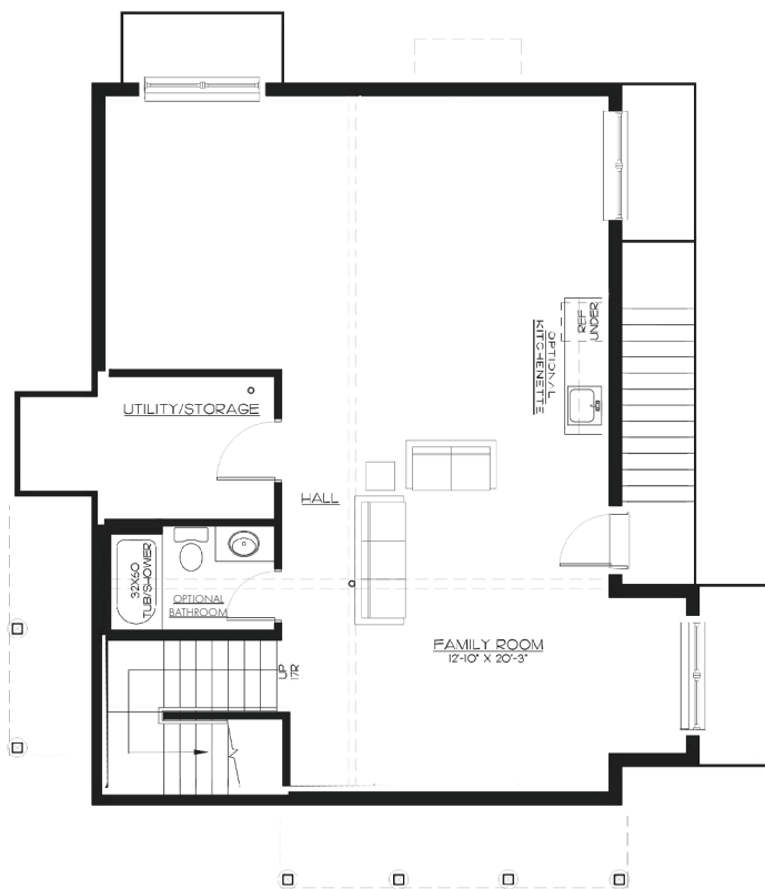
OPTIONAL LOWER LEVEL | 1,127 SF

THE BREEZE 4 BEDROOMS | 3 - 4 BATHS 2,102 - 3,229 SQ. FT